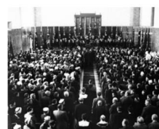
Launching of the appeal in Winthrop Hall