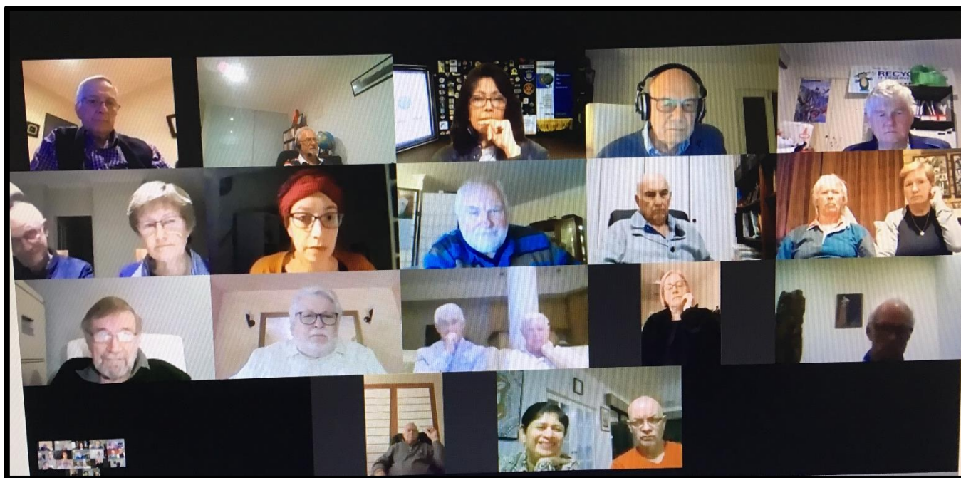
Participants of our latest Zoom meeting,