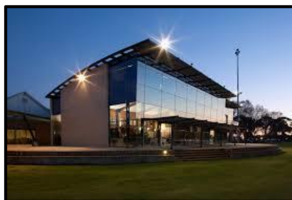
Sundowner held on the grass outside Tompkins on Swan