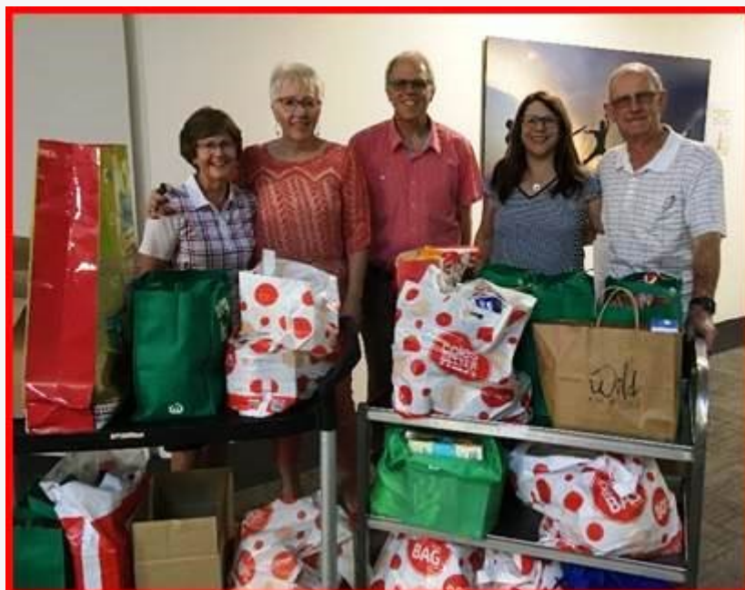
Delivering last year's donation to the Mount Pleasant Baptist Church Pantry