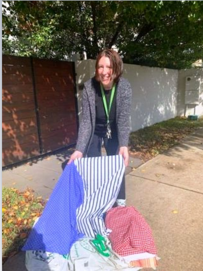
Viana delivering 300 wash bags to King Edward Memorial Hospital

is now almost a full time job in itself. Both Nicole and I both believe strongly in being able to support and give back to local community, with Nicole doing significant other volunteer work as well, and we both believe that kindness and community is key. The things we have achieved in such a short time, the community we have built and the impact we have been able to make across many different aspects and locations, not just within Australia has