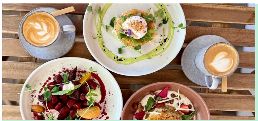
Save up to 50% on dining, shopping and many more things to do

https://www.entertainmentbook.com.au/orderbooks/8788p4