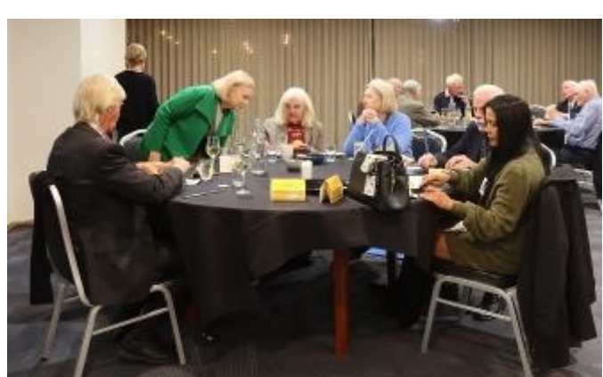
Members enjoying fellowship