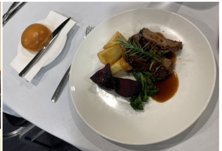
The delicious meal enjoyed by all present