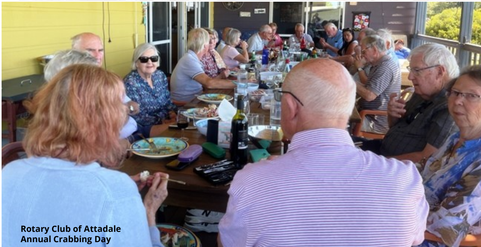
Rotary Club of Attadale Annual Crabbing Day