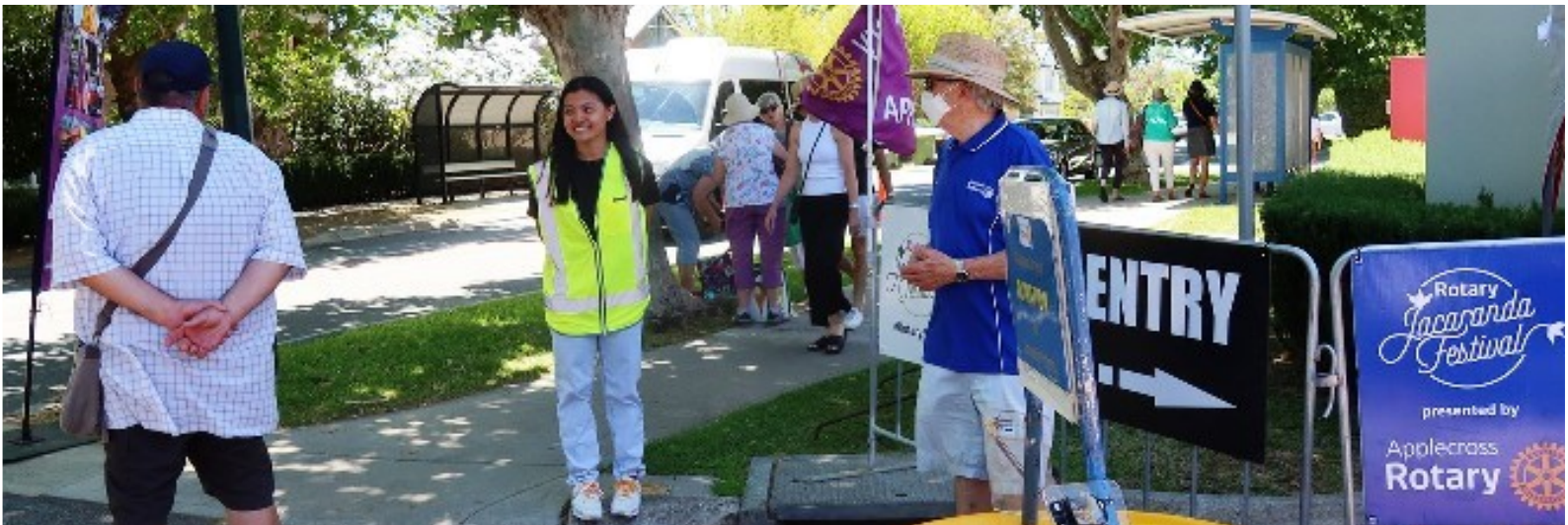
RCA members and students at entry to festival