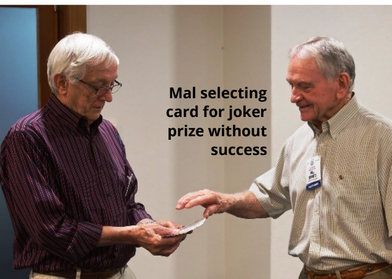
Mal selecting card for joker prize without success