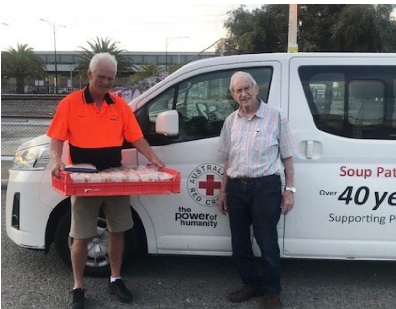
PortCare bread delivery to Red Cross, one community group helping another