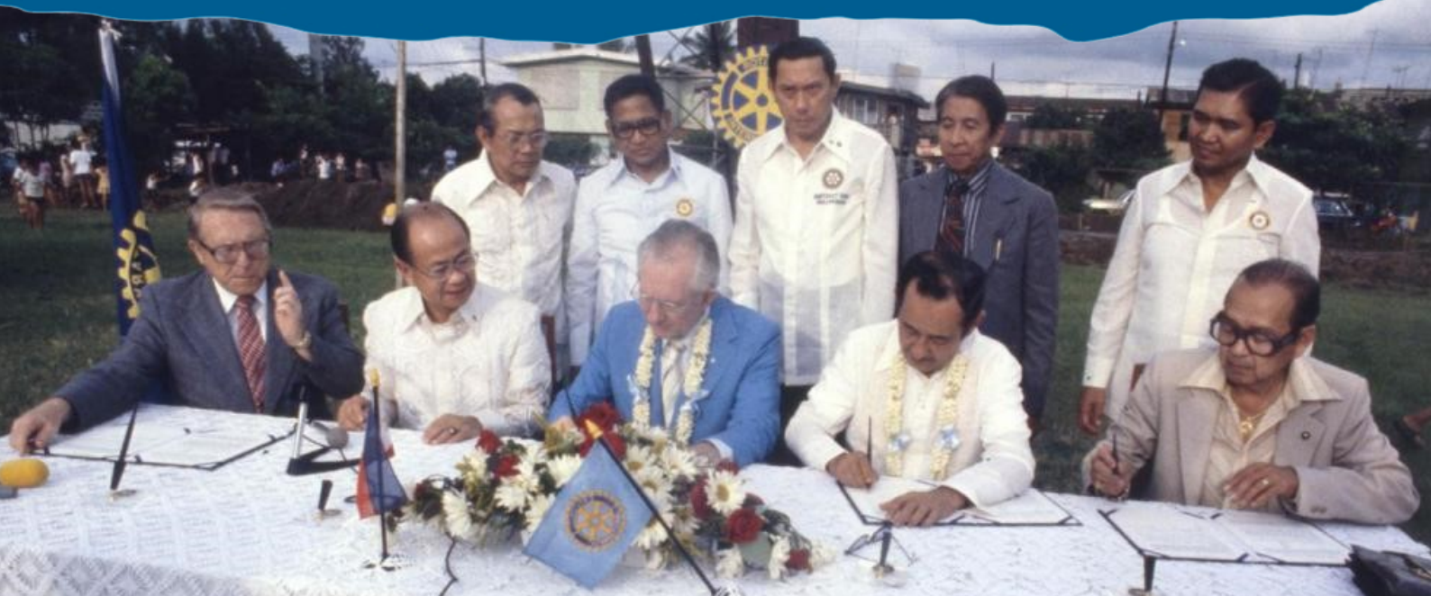
Representatives from Rotary International and the government of the Philippines sign the agreement that starts Rotary International's first polio project

On 29 September 1979, volunteers administered drops of oral polio vaccine to children at a health center in Guadalupe Viejo, Makati, Philippines. The event in metropolitan Manila was arranged and attended by Rotarians and delegates from the Philippine Ministry of Health.