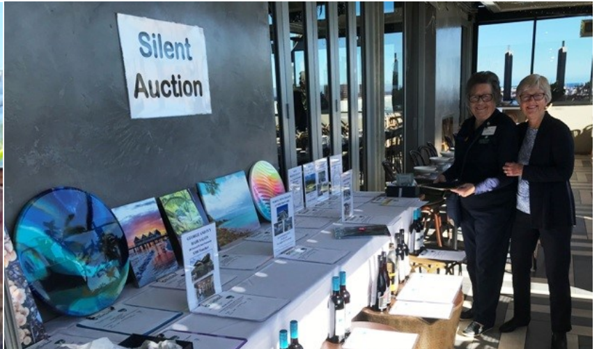
View more ShelterBox fundraiser photos here: 2023 07 ShelterBox Yum Cha Fundraiser