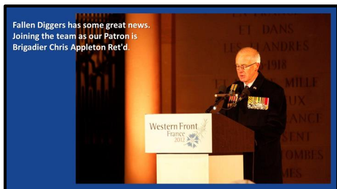
Patron to 'Fallen Diggers