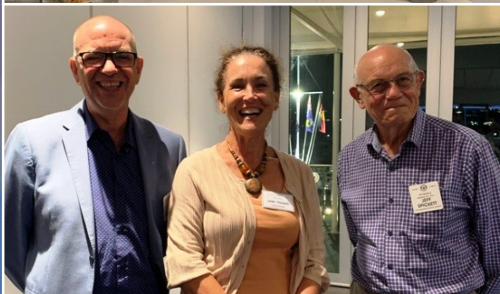
Top 3 photos: Dinner conversations