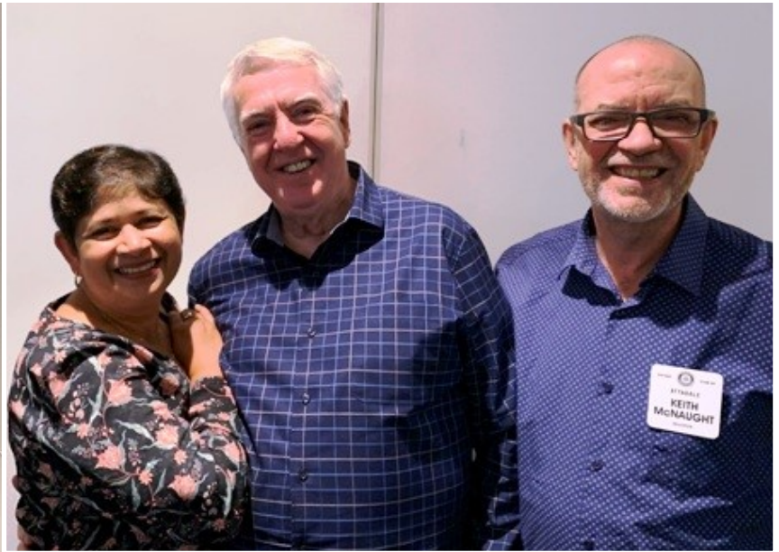
Containers for Change reminder and meeting photos by Heather McNaught

With the 'silly season' nearly upon us don't forget to collect all recyclable cans and bottles for the Containers for Change project. Every 10c adds up, and this is the perfect time of year to carry a spare bag with you when you go to a function and to collect those empties. Our Scheme ID Number is 10350509 - if you can't get to a recycling station bring your bag to the meeting and Heather will happily take it in for you.